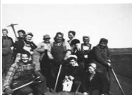
His daughter was Sheerah, who built Lower and Upper Beth Horon as well as Uzzan Sheerah. 1 Chronicles 7:24

When push comes to shove I really don't think that this is an issue between working and non working moms/women, but more of a societal issue regarding what is perceived as being a woman's place and a