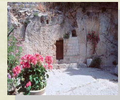
The Garden Tomb in Jerusalem