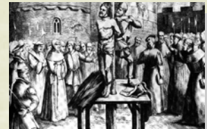
William Tyndale being burned at the stake by his religious peers for translating the scriptures!